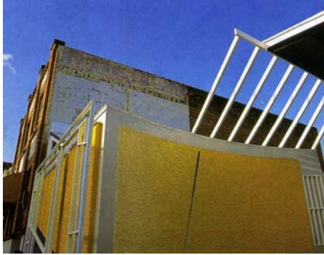
The wall of the leatherworkers studio

employed graduated colour on its exterior wall curved surface this project adapts the idea of an architectural wall that changes colour and extends it. The result is an architectural wall that begins to operate in the manner of an abstract painting. Through the addition of "a line more reminiscent of a canvas than a wall" 9 questions regarding the treatment of architectural wall surfaces are prompted. Why shouldn't wall colour be graduated like it might be in an abstract painting? Why shouldn't a wall surface composition be considered like it might be if it was framed?