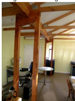
The interior of the leatherworkers studio.

The Potters studio was the third major stage, and it continued the implementation of the original master plan. The extent of new space created was maximised between the four edge limits of the exterior courtyard, the north site boundary, the existing building, and existing service access. The edge of the new