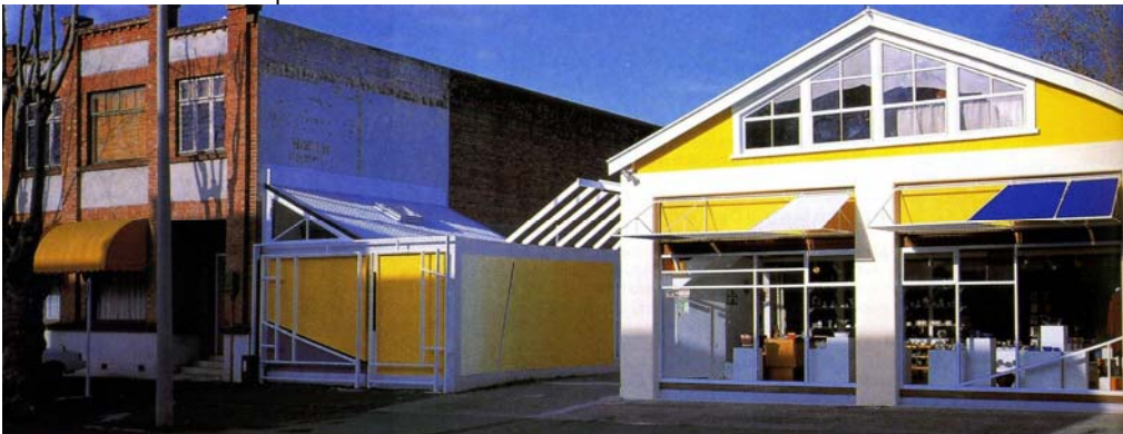
The leatherworkers studio, and sunshades to the Arts centre main façade.

The leatherworkers studio was the new building on site, and its design continued the discussion with the original building. The design was carefully proportioned to create dialogue with the existing architectural orders of the garage facade. Facing the street the original composition was mirrored and distorted. Symmetry was disturbed. Compositionally the gable and proportions of the original were shifted to become a monopitch and flat roof. The figure / ground of the concrete frame was reversed complete with a black framed window introduced within the frame, and a mirrored glass window above the frame within the new half gable. Smooth materials are used contrasted with a heavy modeled roughcast plaster. Primary colours with complimentary neutrals were applied in a manner where the colours are part of and accentuate the formal and surface composition.