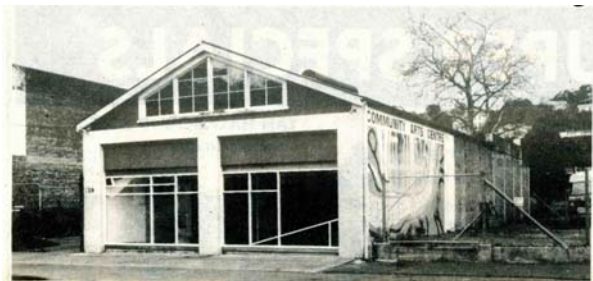
Wanganui Community Arts Centre August 1989.

The first stage began a conversation about composition, with the new in discussion with the old, and every element of the building being questioned in relation to a discussion between architecture and the arts. For example this discussion occurred within the geometry of the plan where the simple potential of a small 15 degree shift in plan, was contrasted with the original orthogonal geometry. The fifteen degree shift explored in plan was also translated into the exterior composition within the glazing bars and surfaces of new walls. The design of the shopfront windows carries on this play of the new against the existing as a basis for a hybrid composition. For example what could and should a shopfront window be? The existing colonial glazed windows lines from the highlight windows were translated downwards as a basis for the new shopfront composition. The detail of the glazing of the two adjacent shopfront windows was played off against each other in asymmetrical balance. Glazing bars were carefully composed as visual elements within the composition. Opening window sashes and coloured glass with lead came were direct glazed into the façade. When compared to conventional shopfront windows these can be seen to test explore the potential of what a shopfront window could become through its generation of an active, rather than neutral aesthetic.