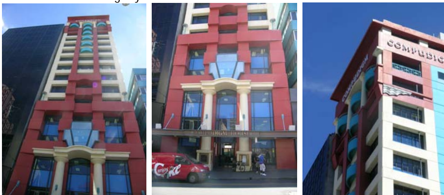
Warren and Mahoney 85 Boulcott Street Wellington 1986-1989