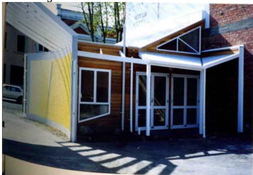
The courtyard side of the leatherworkers studio.

Formally the studio façade is more than skin deep. The asymmetrical duality of the street façade composition is extruded through the building. Craft becomes the dominant concern within the space. Tectonic details become the site of exploration through the critical structural moments where the supporting beam is in turn supported, and celebrated. There is a redundancy created within the structure that makes the play with structure and detail explicit. Here the way the building is made is the basis for its architectural expression. The timbers used are rubbed in Danish oils giving them a patina and aroma that contributes a particular spatial character. Where the studio meets the major exterior courtyard space the exterior surfaces change. No longer plaster the walls are constructed from a natural weathered cedar cladding, under a sheltering small scaled verandah structure contributing a crafted edge to a earthy paved courtyard space.