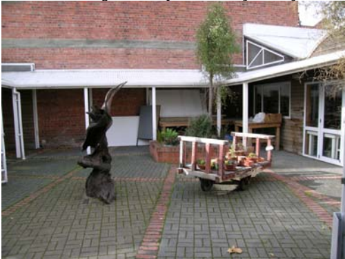
The Potters studio and the exhibition courtyard

studio defines and completes the key exterior space, a substantially enclosed courtyard continuing the simple craft based aesthetic established in the design of the rear of the stage two potters studio. The significant formal move of the stage was the introduction of a curved roof to mediate between a formal extrusion of the front stage half gable along the boundary wall against the adjacent building, all completed with attention to craft in the manner of the leatherworkers studio. The face of the potters studio carries around a narrow rusticated cedar boarded treatment of the rear of the leatherworkers studio completing the courtyard with a less formal and self conscious aesthetic treatment as a deliberately more informal space. Raised planters faced with purpose made unglazed terracotta tiles, and paving extends the 15 degree shift through the paved surfaces to complete and activate the courtyard composition. This paving also extends into and through the adjacent entry courtyard and the footpath adjacent.