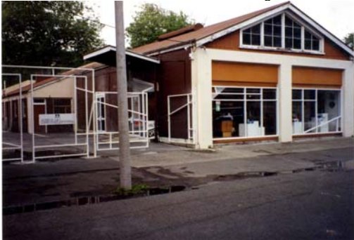
Outline frame of future leatherworkers studio.

like bones of a framed building somehow shifted outside the wall, its role now purely aesthetic. This was a delightful opportunity to extend our discussion of architecture and the arts, these elements conceptualised as a discussion of structure and building fabric.