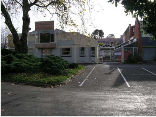
The bay window projection and potters studio from the rivers side.